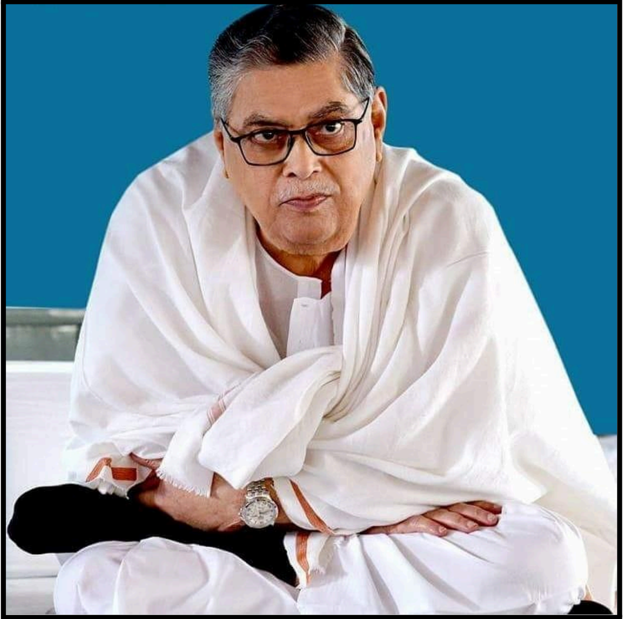
Param Pujiyapada Pradhan Acharyadeva Sree Sree Dada