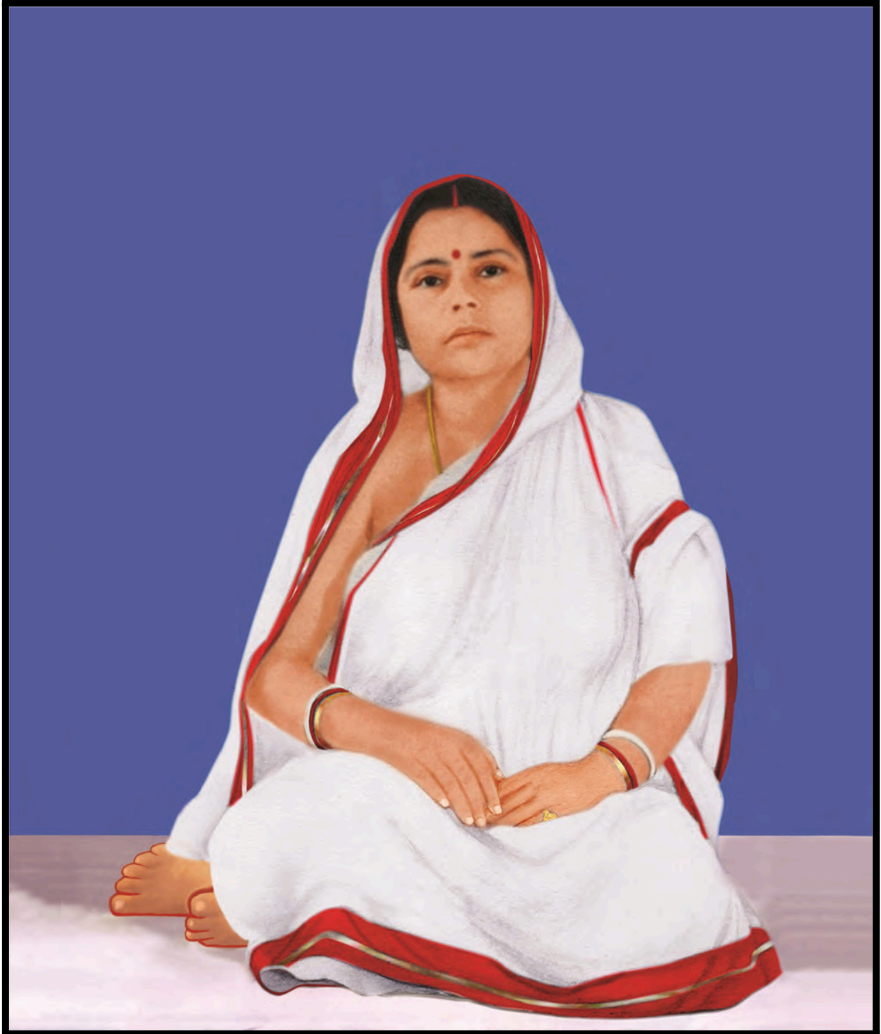
Paramaradhya Sree Sree Boroma