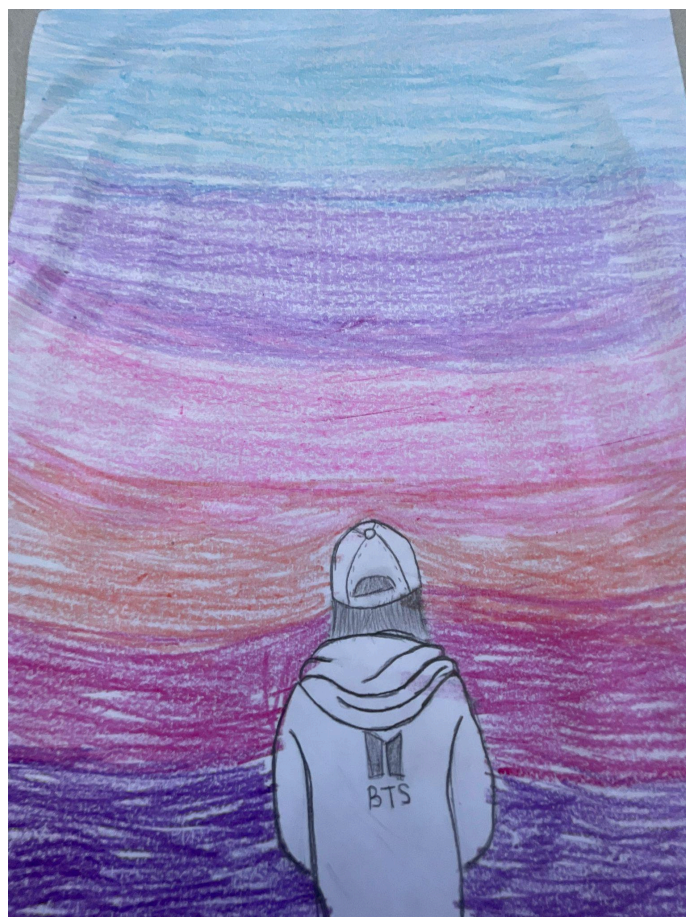
Abstract Following - Blurred Path Painting by Miska Ghosh, Student of Grade 2, California, USA