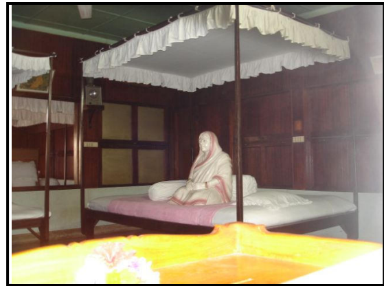
Sri Sri Borma's vigrah