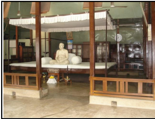
Sri Sri Thakur's vigrah